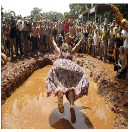
If we had a mud pit, would anyone participate???

live entertainment, as well as a display of our redneck inventions. You are able to vote for your favorite invention at this time as well. We will be deep-frying some yummy roadkill, and eel free to bring along your favorite ":redneck" pub food. (Tator tots seem to be a great idea!!) Also, a couple of "other" redneck games will take place at pub night!